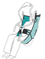
Allegro Pivot Care Sling