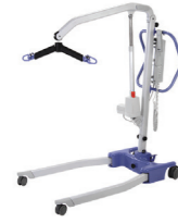
Oxford Advance Floor Hoist