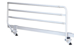
Caremed Alrick 400HR Deluxe Bed Safety Rail