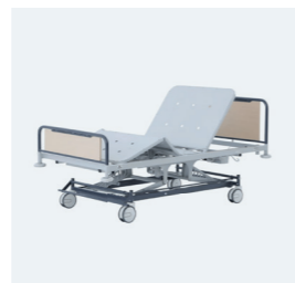
Caremed Alrick 2400 Bariatric Tilt