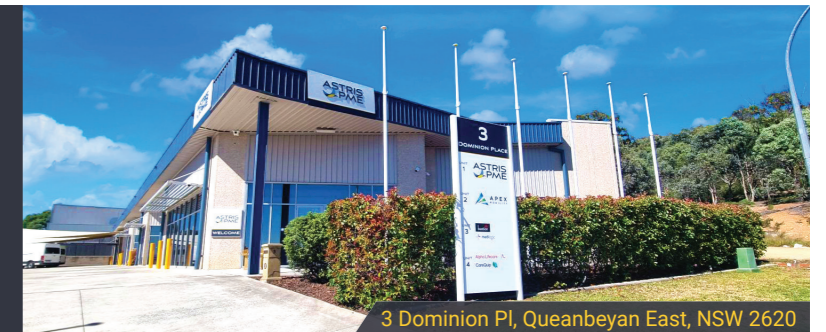
3 Dominion Pl, Queanbeyan East, NSW 2620