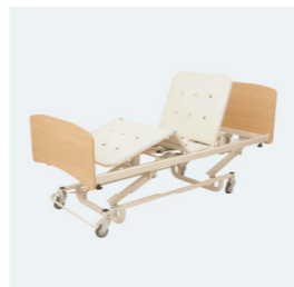
Caremed Alrick 7001