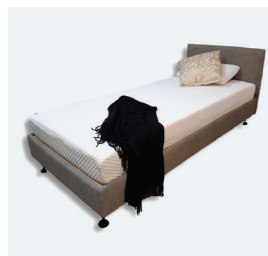
Icare Companion Bed