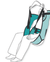
Allegro Care Sling with Head Support