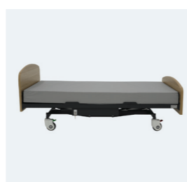
Caremed Alrick Mental Health Series