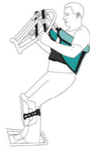
Allegro Standing Transfer Sling