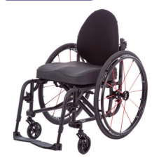
TiLite Aero X