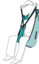
Allegro Junior Sling