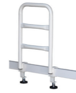
Caremed Alrick CLP400 Support Rail