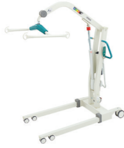
Allegro Forte 320