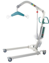
Allegro Alto Lift MkII 200