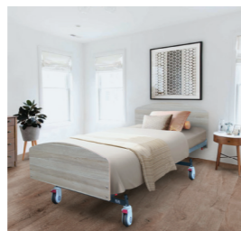
Caremed Alrick 2300 Bariatric Series