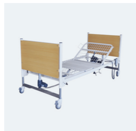
Caremed Alrick 5000 Series Folding