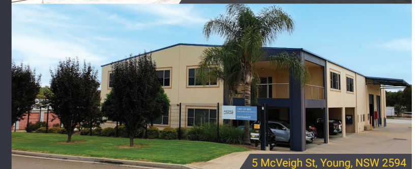
5 McVeigh St, Young, NSW 2594