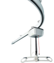
Monarch Fixed Ceiling Hoist