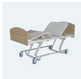
Caremed Alrick 2001 Mark II Series