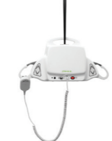
Monarch Portable Ceiling Hoist