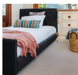
Casero Vogue, Mode, Plus, Duo