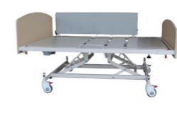
Caremed Alrick Cot Side Protectors