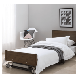
Caremed Alrick EN9 & EN7 Endless