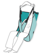
Allegro General Purpose with Head Support