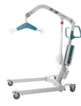
Allegro Sonata 150 ELS