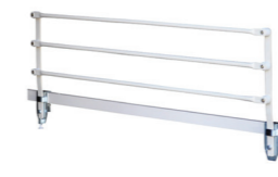
Caremed Alrick 360HR Horizontal Bed Rail