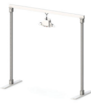
Monarch Gantry System