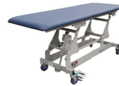
Caremed Alrick 3004 Paediatric