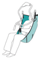
Allegro Pivot Sling