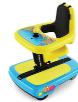
Permobil Explorer Mini