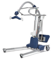
Kerry Multi Lift