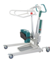
Allegro Salsa 200