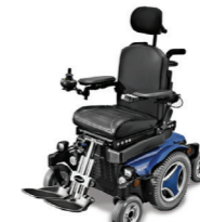
Permobil M300 PS Jnr