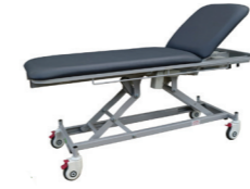
Caremed Alrick 3250