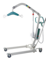
Allegro Sonata 150