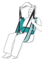
Allegro Care Sling