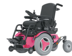
Permobil K300 PS Jnr