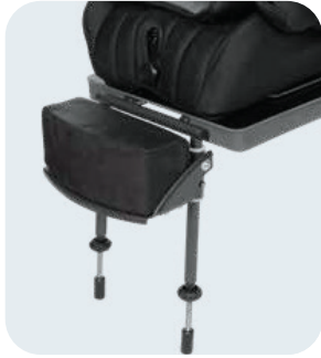
Footrest , short with footrest adapter and footrest pad