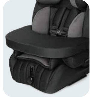
Table = playtray and additional impact shield