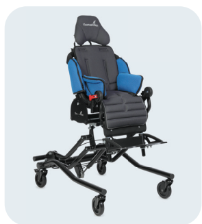
Hi-Lo Indoor Base