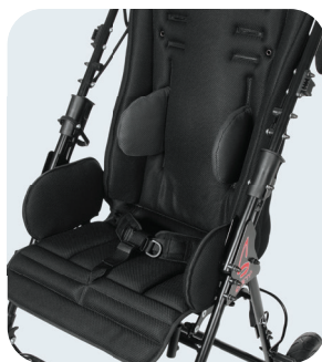
Lateral Trunk Support