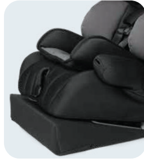
Seat wedge , below (+ 10°)