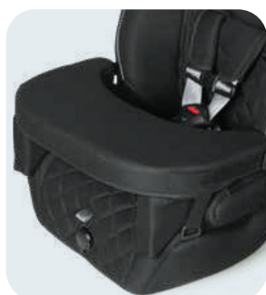
Table promotes the straightening up and stable posture of the child, provides the child with all-round support and safety.

Seat wedge (inside) supports an upright pelvic position, LATERAL TRUNK SUPPORTS (METAL CORE) for optimum support of the upper body.