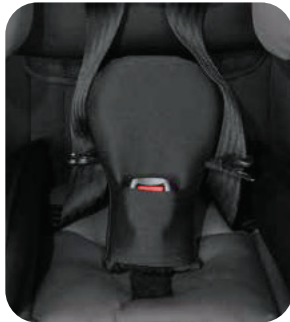
Crotch pad , large