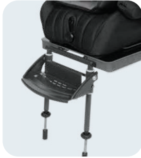
Footrest , long with footrest adapter