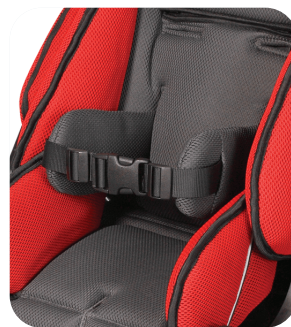
Lateral Trunk Supports